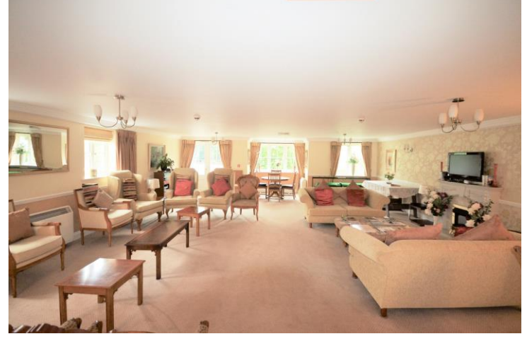
Book a Viewing

01243 861344 Sales@ClarkesEstates.co.uk 27 Sudley Road, Bognor Regis, PO21 1EW http://www.clarkesestates.co.uk